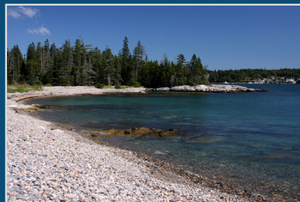
BAR HARBOR, MAINE

Discover Ocean Views, Dramatic Scenery, a Treasured National Park and Lively Bar Harbor Village in Bar Harbor, Maine for Four Days & Three Nights at The Bluenose Inn - Bar Harbor for Two (Land Only)